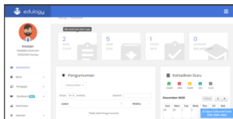
Gambar 2. Teacher Dashboard

of the teacher dashboard on the LMS edulogy is shown in Figure 2.