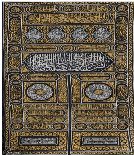
Image 1. A detailed picture of the curtain of the door of the Kaaba, through which it becomes clear the aesthetic relationship of the feature of balance within the overall design structure of the curtain ( http://www.emadphoto.com/#/makkah )

balance: First, symmetrical balance: Is the simplest, clearest, and least diverse type of balance, and it can be achieved in the simplest form of The path of symmetry. Second: Asymmetric equilibrium: In this type of equilibrium, the opposing gravity is distributed on both sides of the axis with its asymmetry, and this type of equilibrium is more vibrant and attractive because it bears the characteristics of diversity and change between the different shapes and their weights" (Al-Husseini, 2003). An example of this is evident from Image (1) of the door of the Kaaba curtain that the feature of balance was provided in the overall design process of the curtain in terms of balance in the arrangement and distribution of forms of linear formations and plant decorative units between the right and left side of the curtain to create a state of aesthetic organization.