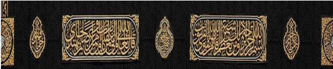
Image 5. A picture of the geometric and iconic linear formations in the covering of the Kaaba that embodies the character of harmony and proportionality between the design of sizes, areas, lengths and measures