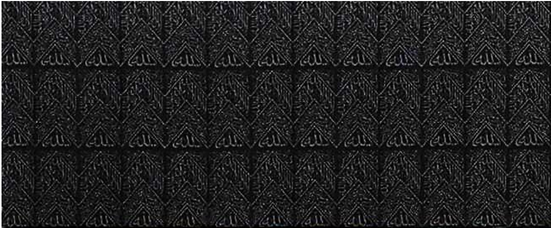
Image 3. A partial picture of a linear formation of the covering of the Holy Kaaba, showing the characteristic of rhythm through repetition of the same linear structural form in a rectangular shape on the rest of the covering of the Kaaba