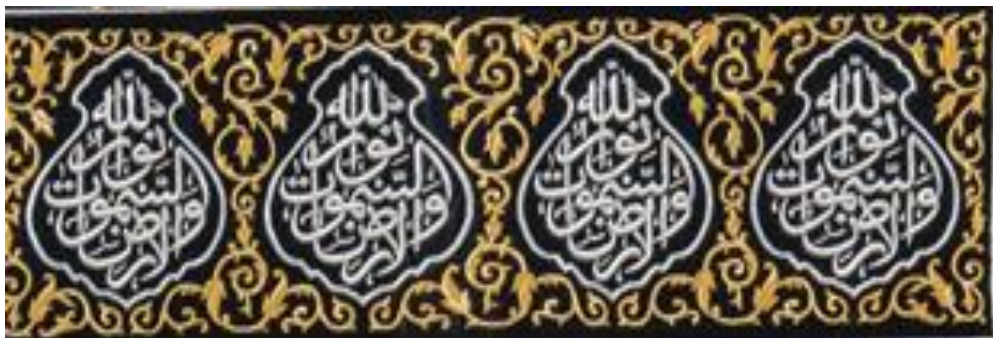
Image 6. A picture of the iconic linear formations in the curtain of the door of the Kaaba that embodies the property of contrast and contrast between the elements of shape and color ( http://www.emadphoto.com/#/makkah/ )