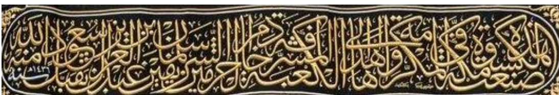
Image 8. A picture of the linear strip formation of the eastern side in the covering of the Kaaba, embodying the character of the sequence of the reading sequence