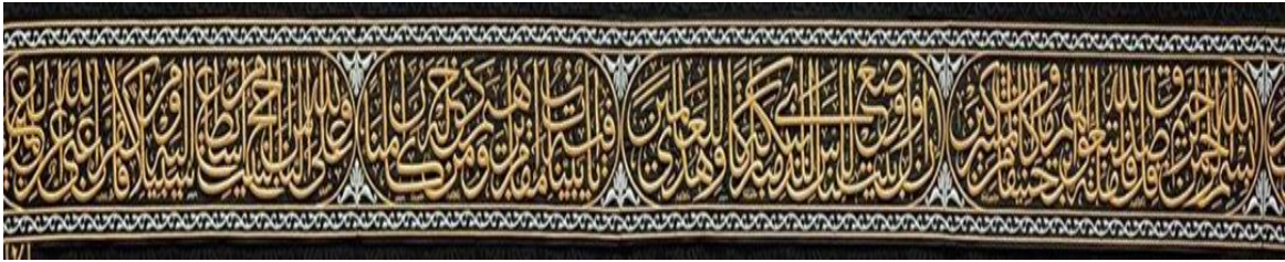
Image 2. A picture of the ribbon belt from the covering of the Holy Kaaba showing the supremacy of the complex clear thuluth line in the construction of the linear composition and the predominance of the golden color ( http://www.emadphoto.com/#/makkah/ )

An example of this is evident from Image (2) the predominance of the clear thuluth line, which is installed in the total linear formations in the ribbon belt in the Kaaba covering and the golden color, created a strong polarizing point for the design process of the kiswa .