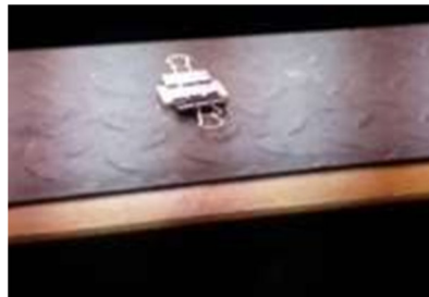
Figure 2. DSSC Performance Test

The DSSC performance test was performed after the dye was tested using solar simulator equipment, as displayed in Figure 2.