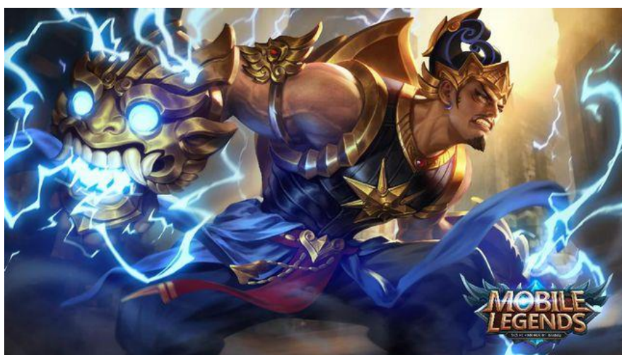
Figure 2. Gatorkaca hero with Antakusuma armor and Brajamusti-Brajadenta twin gauntlet

In the story, both of the twin souls of his uncles Brajamusti and Brajadenta resided into Gathotkaca's hands and added his strength. In the game, these attributes are visually manifested in his notable twin gauntlets, with which he can fly across the skies like lightning and hunt down his enemies. His ultimate skill in the game, Avatar of Guardian , perfectly illustrates the given description where the hero flies and jumps to the designated area, knocking nearby enemies.