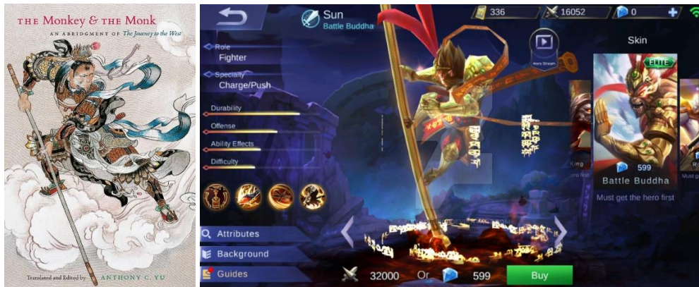
Figure 4. victorious Battle Buddha Sun Wukong from Journey to the West and Battle Buddha Sun from Mobile Legends are wearing magical gifts, including golden chain mail, a phoenix-feather cap, and cloud-walking boots

The legend said that Sun Wukong was given three special hairs by Guanyin (who received them from the Buddha himself), which could be used in dire emergencies. All the other hairs possess magical properties, capable of being transformed into clones of the Monkey King himself. Similar to the original story, Sun is a hero who possesses clone technique as his ultimate skill and passive skill in summoning monkeys. His other skill is the golden cudgel strike which he and his doppelganger use the golden cudgel to smash his enemies. In the original story, Wukong uses it to fight off, making him as a formidable warrior.