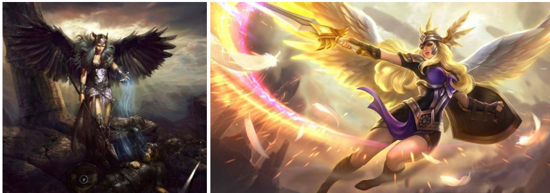
Figure 3. Freya as the Ruler of Death in Norse Mythology (left) bears a resemblance to Freya in her Valkyrie mode in MLBB (right)