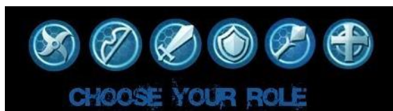
Figure 6. Symbols of heroes' roles in Mobile Legends (from left to right: Assassin, Marksman, Fighter, Tank, Mage, and Support)

When it comes to five senses modality, the game undoubtedly presents a livelier and interactive game or entertainment due to its audio and visual features. Some of the dialogues and important events from the original literary works are presented in the heroes' speech and the in-game skills. Consequently, this has successfully transformed the respective figures to the new media while preserving their identities. Temporal and space modalities go without saying become the most distinctive feature in which Gatotkaca from ancient Indian Hastinapur, Freya from Scandinavia region, Wukong from ancient China, and Lancelot as a British Medieval knight, assemble together in the fictional world of The Land of Dawn where the two battlegrounds and the places of origin of the heroes in Mobile Legends are located. Ultimately, the in-game mini-map on the top left of the screen can give players quick information about various things, such as teammate position, approximate enemy locations, lord or turtle places, ping/connection notifications and more. Semiotic modalities in the adaptation are represented in the new symbols, icons, and indexes of the heroes for the online MOBA, which are based on the original texts.