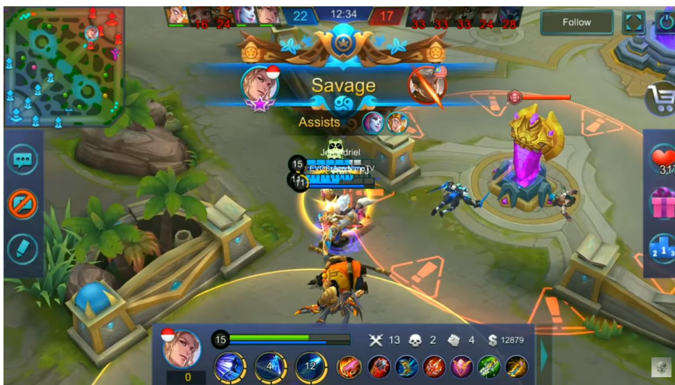
Figure 5. From unsung hero in Arthurian Legend , Lancelot becomes a savage hero in MLBB