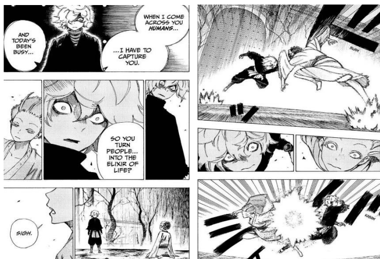
Figure 5 and 5.1. Gabimaru is triggered by the opponent (Kaku 2020, 23)

Gabimaru's second meeting with a Tensen named Zhu jin (A member of the Tensen Race). The face expression in figure 4 shows how astonished he is when he discovers that the thing behind him is not a normal creature. As seen in Figure 4.1, panels 1 and 2 in the bolded narrative text from the telepathic speech bubble depict Gabimaru's thoughts about his enemy "something different" and "It's not a human," emphasizing Gabimaru's amazement and wonder at how strong and what the opponent could be.