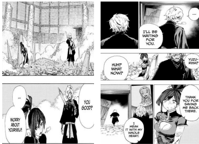
Figure 11, 11.1, 11.1, and 11.2. Gabimaru team working with his teammate (Kaku 2020, 67, 70)

In figure 11 and 11.1 Gabimaru shows less ego by not working alone and teams up with Yuzuriha (his teammate). Figure 11.1 and 11.2 Gabimaru is showing sympathy and cares more about Yuzuriha's condition than his own as shown in the narrative text from figure 34.1 “You good?”. Recalling memories of his wife, he learns the feeling of gratitude by saying thank you with his whole heart.