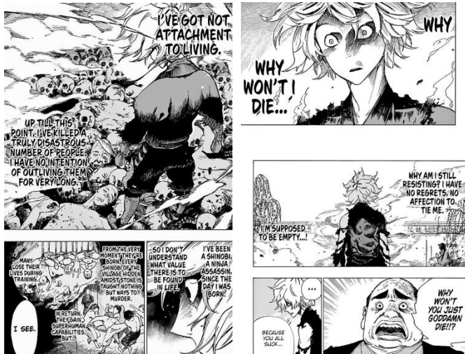
Figure 2 and 2.1. Gabimaru is questioning his true self and why he did not want to die (Kaku 2020, 1)

former assassin searching for redemption. His interactions with other strong-willed people, such as the eclectic assortment of criminals and warriors who accompany him, influence his thoughts and values.