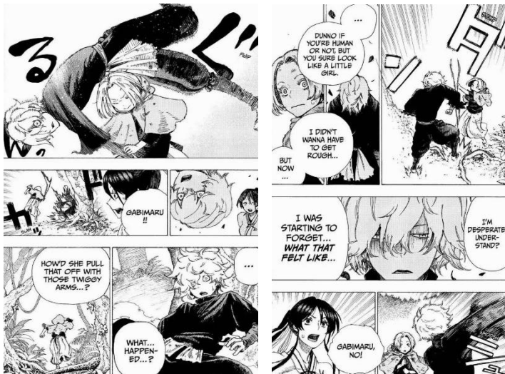
Figure 3 and 3.1. Gabimaru encounter with mysterious little girl (Kaku 2020, 17)

strong willed motivation to live and even triggering his nature self as a ruthless assassin as seen in the figure 3 and 3.1 .