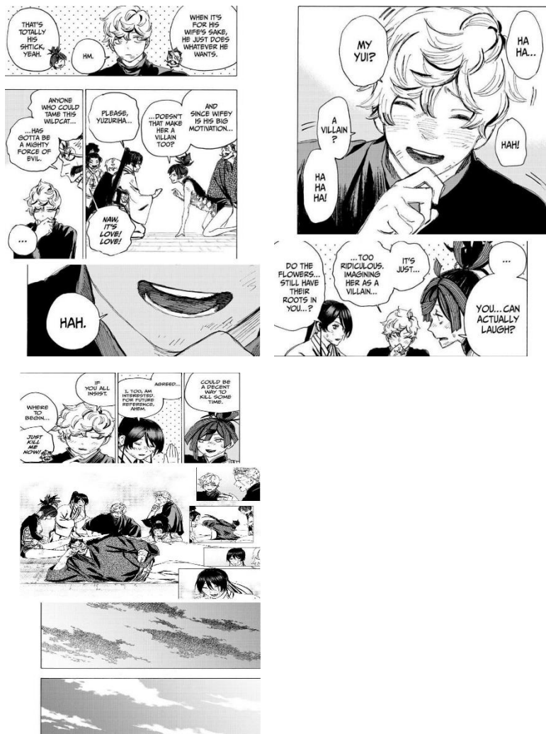
Figure 14, 14.1, 14.2. Gabimaru laughing for the first time

Gabimaru's desire to enhance his connection with his wife, as well as his self-esteem, mabe influenced by his internalized moral and ethical convictions.