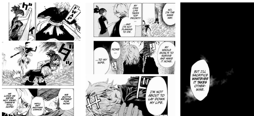
Figure 10, 10.1 and 10.2. Gabimaru is saved by his teammates (Kaku 2020, 67)

During this battle, there are no speech bubbles in the panels indicating how intense and one-sided this battle is, with every panel showing how Gabimaru is vulnerable and got brutally attacked by the monster. Even with how powerful Gabimaru is he can't handle the battle by himself.