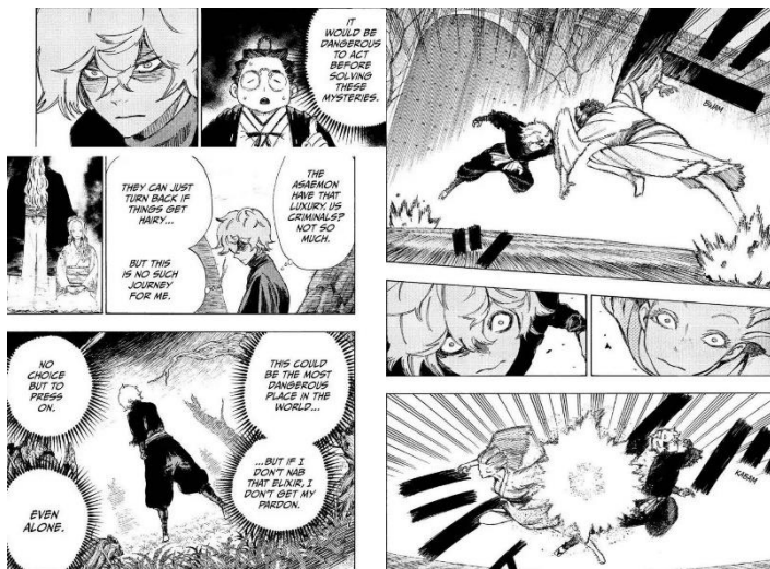
Figure 6 and 5.1. Gabimaru chooses to ignore the team regulations (Kaku 2020, 23)

In figure 6 Gabimaru consciously remembers his teammates warning about the danger to act in that time but his ego consciously chooses to ignore it because he needs to learn more about the elixir of life. In figure 5.1 Gabimaru's Id unconsciously allowing his instinctual mind to take over and attack the enemy reflects an impulsive and primal response to a perceived threat.