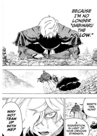
Figure 8. Gabimaru shows respect to his opponents (Kaku 2020, 27)

Gabimaru encounters another group of criminal and executioner who were sent to the island, in his weakened state after fighting with Zhu jin in the figure 4 till figure 6 . Gabimaru tried to imagine how he could fight and win against the opponents and ended up dying in all of his imagination as we can see from the panels in figure 7, 7.1, and 7.2 . Can't even think about how to win against the opponent, frustrates him in the process. the enemy.