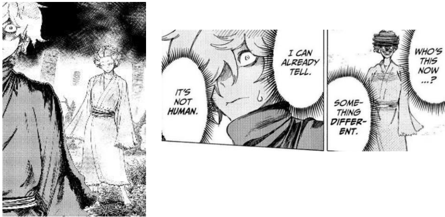
Figure 4 and 4.1. Gabimaru second encounter with another Tensen race (Kaku 2020, 23)

Gabimaru's second meeting with a Tensen named Zhu jin (A member of the Tensen Race). The face expression in figure 4 shows how astonished he is when he discovers that the thing behind him is not a normal creature. As seen in Figure 4.1, panels 1 and 2 in the bolded narrative text from the telepathic speech bubble depict Gabimaru's thoughts about his enemy "something different" and "It's not a human," emphasizing Gabimaru's amazement and wonder at how strong and what the opponent could be.