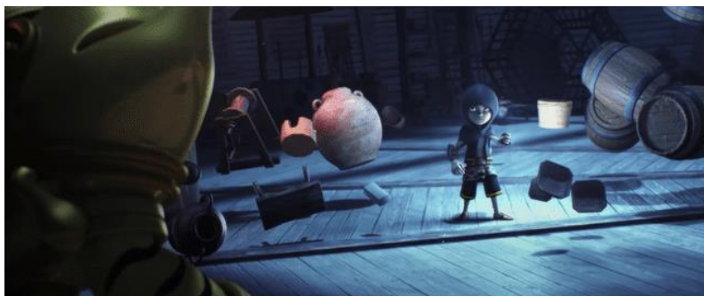
Figure 10. Disruption of Identity "Knight Kris" (2017)

scene, they are between the real world and the Farnha world. This space disruption creates a misalignment between the different worlds, where the real and magical worlds become one and seem like the ordinary world.