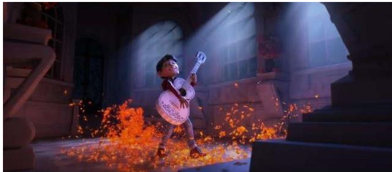
Figure 1. Irreducible Element "Coco" (2017)

An irreducible element cannot be simplified. This characteristic defines magical realism, which emphasizes the presence of events that contradict reality.