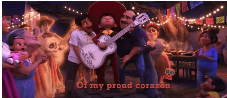
Figure 7. Merging Realism "Coco" (2017)

The incorporation of realism combines the natural world and the magical world.