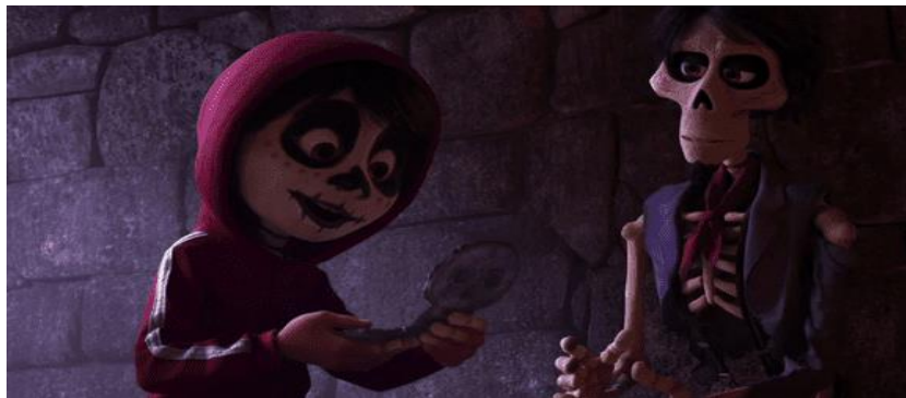
Figure 11. Disruption of Identity "Coco" (2017)

Miguel's long journey back to the real world is a time disruption because Miguel returns to the same time he left the real world and moved to the spirit world. This disruption is considered to violate the temporal time flow of the real world. This disruption refers to illogical changes or discrepancies in time. It causes tension between the world of the world and highlights the not- always-fixed nature of time that individuals can influence in a narrative.