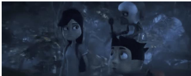
Figure 13. Disruption of Space "Knight Kris" (2017)

In the movie Knight Kris (2017), the previous knight's curse that made Asura into a stone statue and locked him up in an ancient temple for 1000 years is disturbing and sounds impossible because the curse and the Kris are so old. This goes against the expectation that ancient buildings or structures should have deteriorated or decayed over time.