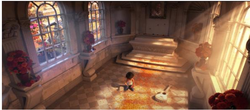
Figure 10. Disruption of Time "Coco" (2017)

for the spirit to return to the real world. The photo is a clear example of space disruption, as magical things in the spirit world can be brought into the real world and vice versa.