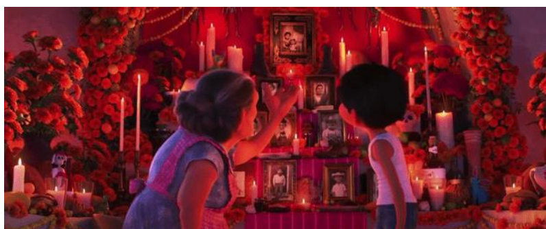
Figure 3. Phenomenal World "Coco" (2017)

The phenomenal world is the empirically recognizable world setting.