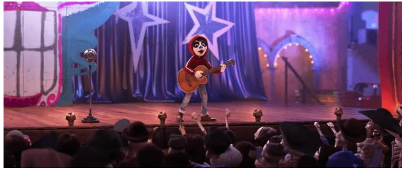
Figure 5. Unsettling Doubt "Coco" (2017)

The unsettling doubts exist between the natural world and the magical world.