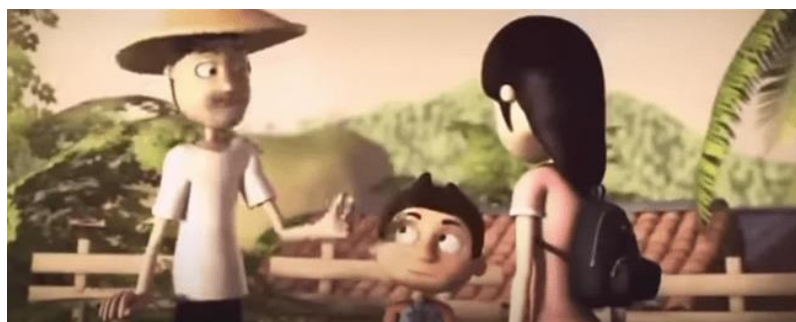
Figure 4. Phenomenal World "Knight Kris" (2017)

In the film Coco (2017), Miguel's life in Santa Cecilia as the son of a shoemaker is a representation of the phenomenal world. His life is surrounded by Mexican culture and traditions. One of them is the tradition of Día de los Muertos, which is a celebration of the commemoration of death by placing a photo of the deceased family on the Ofrenda. As said by Elena in this scene, the installation of the photo is not only to remember the deceased family but also a bridge for the deceased family to return to the world to celebrate Día de los Muertos with their family. Día de los Muertos traditions are believed to connect the natural world and the magical world.