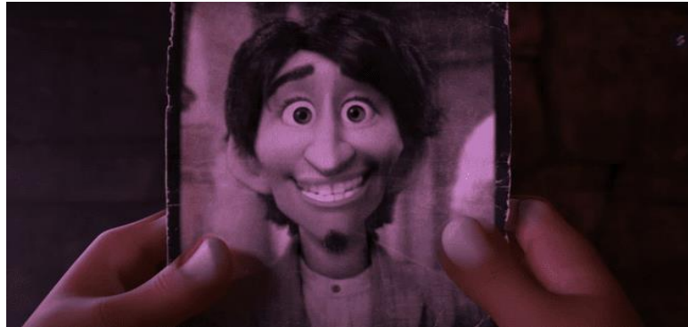
Figure 9. Disruption of Space "Coco" (2017)

Disruption of time, space, and identity can change the real world into a magical world that cannot be explained logically.