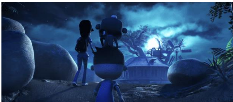
Figure 8. Merging Realism "Knight Kris" (2017)

The end of the movie Coco (2017) shows how the Día de los Muertos tradition occurs. The deceased's family celebrates the tradition by eating and singing together in the house's courtyard. As she does in the scene, she sings Proud Corazon Objects. Food in the real world can also be held and tasted just by touching it, and she instantly moves from the real world to the spirit world. This scene proves that memories can cross the boundary between life and death in a cultural heritage tradition. It also proves the interconnected merging of the natural and magical worlds.