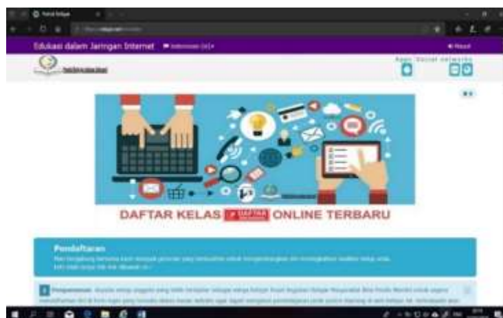
Figure 4. web learning interface

The result of this alpha examiner is measuring the level of validation obtained from the product produced through the assessment of experts in their field. This test is to find out the overall research both in terms of material and media developed. So that researchers are able to analyse deficiencies and parts that have not been in accordance with the ideal criteria and are suitable for later follow up by researchers.