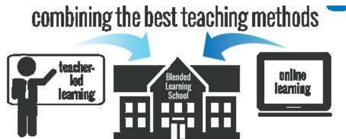
Figure 2. Grand Concept of Hybrid Learning

The results of product development in this study are in the form of learning web combined with Student Worksheets where both are integrated to complement each other between conventional learning and distance learning in the form of online learning to be implemented in learning Physics which in this research development focuses on one sub teaching material Newton's Law. The procedure for media development has been taken based on the development stages of Alessi & Trollip (2001).