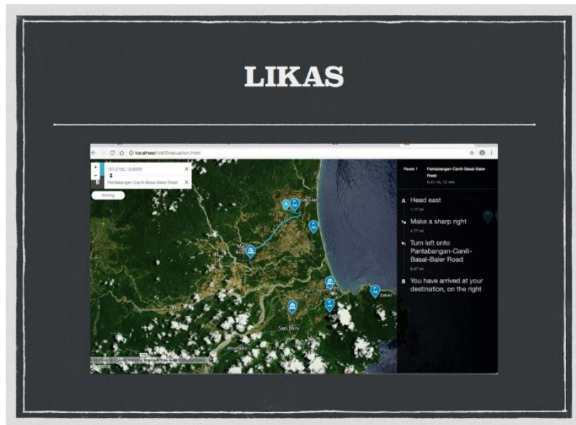
Figure 3. Likas Module

Likas Module requires a review occasionally and made publicly available since this is a mini-app inside the system that points to where you are and where are your nearest lifelines. Figure 3 shows the Likas Module display.