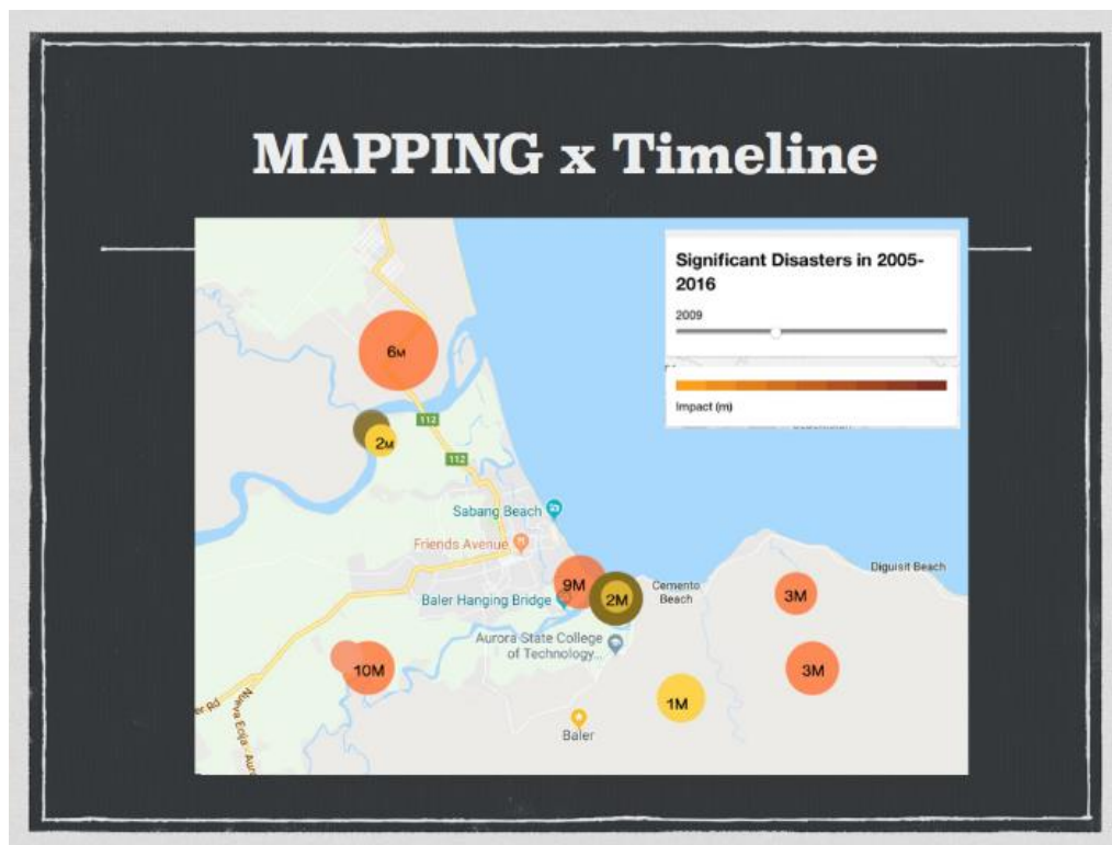
Figure 4. Mapping Module

The mapping module offers trend mapping and heat mapping functions. This is beneficial to residents and investors planning to build or put up assets in the municipalities. Figure 4 shows the mapping module display.