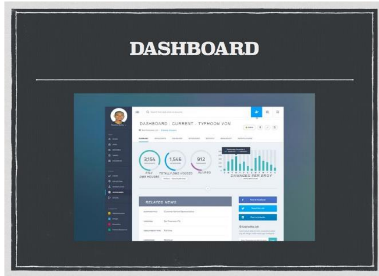
Figure 1. Dashboard

The dashboard consists of important information on the account, including critical areas, real-time analysis, forecast, a news feed, and the most efficient response based on records. Figure 1 illustrates the dashboard display.