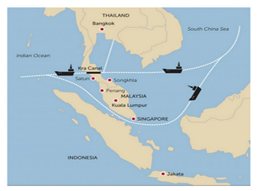
Figure 1. The Kra Isthmus Canal Route

The function of the Canal is believed to ignite Thailand's potential as a core for mobilization and various logistics industries in Southeast Asia. This sophisticated infrastructure could strengthen bilateral and multilateral collaboration with incomparably higher profits among ASEAN countries. According to a development analysis specialist, Pakdee Tanapura, the prompt growth of industry and business could be accelerated by functioning the Canal (ASEAN Affairs Magazine, 2009). Every dependable maritime mobility can undoubtedly have a meaningful impact. If the Canal progressed maritime venture in a concentrated area, later the business and commerce would also come to alive. Apart from the advantages that would be gained by Thailand, some other positive