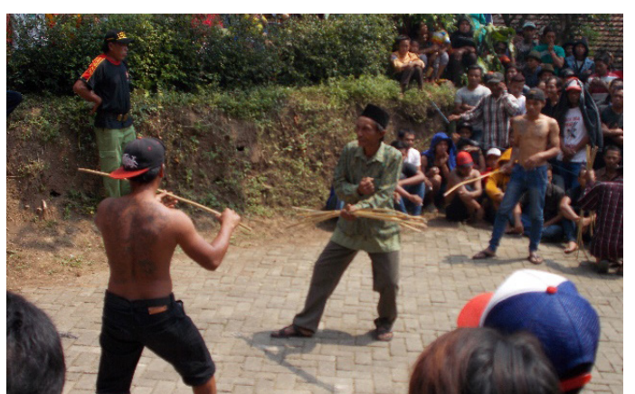
Figure 3. Two men on the right and left holding rattan stick will beat each other. The old man in the center plays as "referee". This is the most favorite attraction in a whole processing of bersih desa (July 2017).

Almost all villages in Trawas District held bersih desa except the strong Muslim followers' village. According to Islam, it is forbidden to make a ritual which is not based on the Quran and Hadits. The controversy raised between the villagers who believe in the tradition and who does not. The first party believed that the disaster and mass trance will strike all villagers if tandak and bersih desa are not being held. On the other side, Moslem leaders said that such rituals included as syirik (not believed that Allah is the only God of human being). Therefore, in the place where their lurah (head of the village) is a strong Moslem such as Desa Tamiajeng, bersih desa is not being held. Continuity of this tradition not because of their resilience against religious revolution, but from economic factor. The changing of economic base amongst people from preindustrial to industrial brought considerable impact to their regular activity, life experience and their cosmology. For example, rice-cultivation and dry farming are not the only economic activity which can be be found in Kedungngudi and Seloliman. There are many cottages, homestay, hotel, and tourist destination spread across main road between Trawas-Penanggunan and Mojosari. Therefore, not all the village practice their ancestor tradition