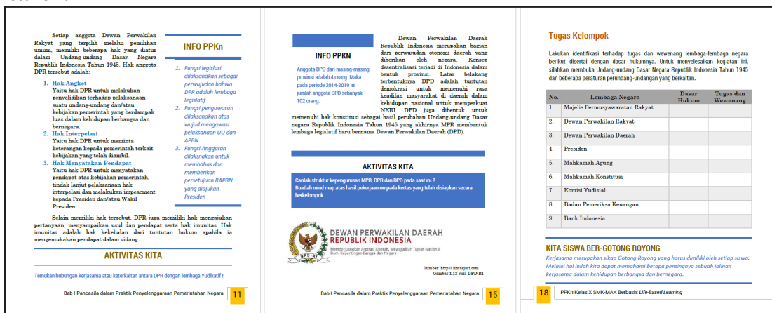
Picture 2. The feature of activity and group task