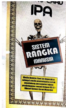
Figure 2. After the revision