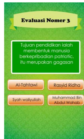
Fig. 5. The quiz menu.

The quiz menu provides the evaluation learning. Students can answer and get the score directly.