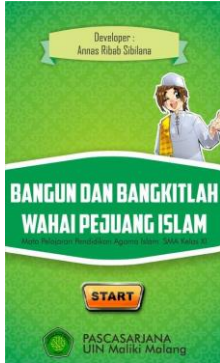
Fig. 1. Introduction page

In this page, there are creator name, icon, Islamic cartoon animation, start button, and the title that contain text about the second grade in Senior High School. It can be marked that this media use to second grade students. Introduction is made to attract students. Introduction page shown in Fig. 1.