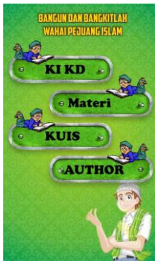
Fig. 2. Main menu of learning media Android based.

In this menu, there are title and buttons which are used direct us to the menu what we want, such as KI, KD, Material, Quiz, and Author, it shown in Fig.2.