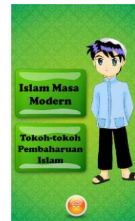
Fig. 4. The material's menu.

This learning material provides map's concept about Waking up and Rising Islamic Warriors. The first material will study about Modern Islamic. In this material provides factors of Islamic rising, then innovations to promote Islam. The second material describes about Islamic figures.